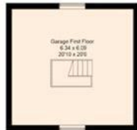
Garage First Floor

(Not Shown in Actual Location / Orientation)